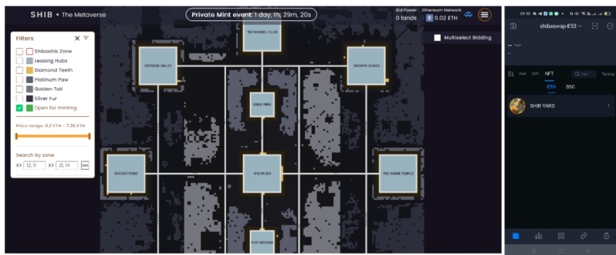
Figure 1. Metaverse mint plot land, and their ownership proof on Hot Wallet.

The Metaverse needs NFTs to authenticate digital objects and prevent fraud. Blockchain-stored NFTs cannot be copied. The digital object can only be claimed by the NFT owner. This prevents scams and verifies Metaverse digital assets. As you can see in figure 1.